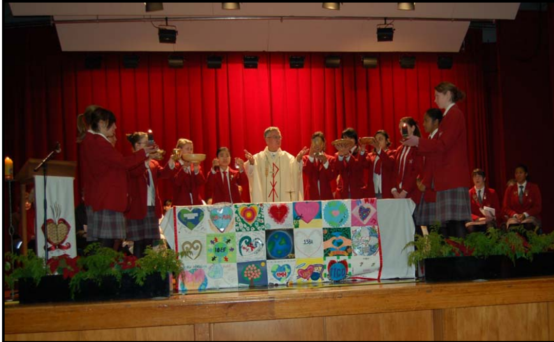
Archbishop John Dew with our new Eucharistic Ministers Sacred Heart College Mass for the Feast of the Sacred Heart