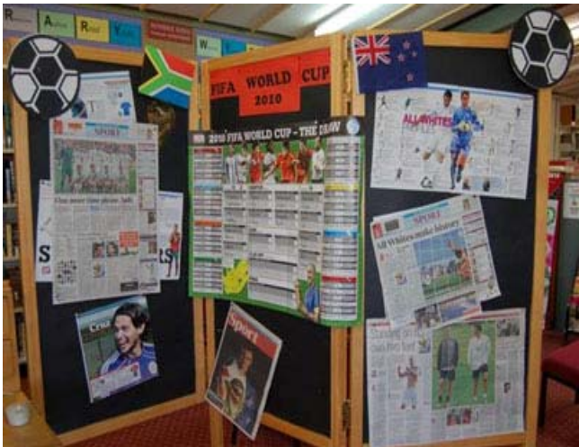
Term 2 Displays